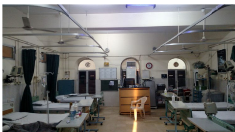
Female Ward / ICU