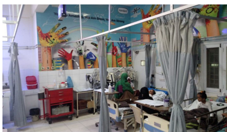
Paediatric Ward / ICU

FOBC has three separate Wards / ICUs for Paediatric, Male & Female.