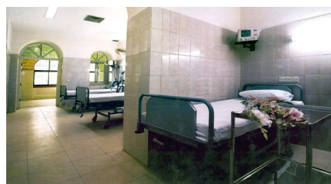
Male Ward / ICU